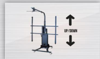
Electric Mobile Stand with Motorized Bracket (Optional)