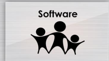
Learning support and presentation software.