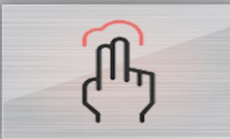
Multitouch Touch Support

Solusi cerdas untuk kegiatan belajar mengajar hingga presentasi, serta mempunyai banyak fitur-fitur menarik dan interaktif. Anda dapat mengekspresikan secara bebas kegiatan belajar mengajar seperti menggambar, menulis, hingga presentasi serta mengoperasikan secara penuh kontrol komputer hanya dalam sentuhan jari pada papan interaktif.