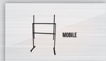
Mobile Stand (Optional)